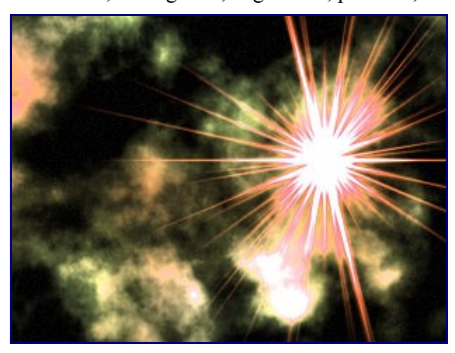
High energy cosmic radiation can damage your cells

substances, most grains, vegetables, potatoes, and fruit were below the safe limits.